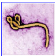
Image size: 367 × 367

Find other sizes of this image: All sizes - Small - Medium